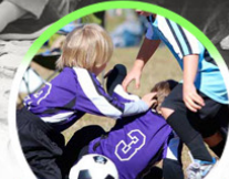
Sports Injuries & Athletes