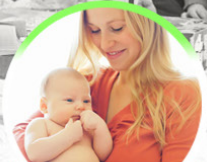
Pediatric & Prenatal