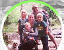
For All Ages