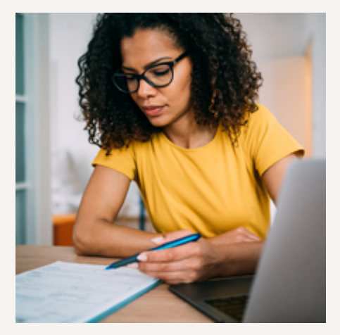
How to Stay Productive During Your Day

Ever feel like you're slipping off track and falling victim to the dreaded mid-day slump? Instead of making it a normal part of your day, consider these helpful tips for staying productive.