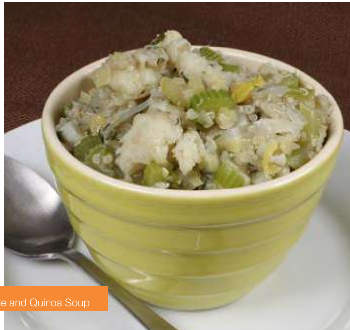
Vegetable and Quinoa Soup

Preheat oven to 350 F. Rub potatoes with 1 tablespoon olive oil and place on baking sheet. Wrap a head of garlic in aluminum foil and place on baking sheet with potatoes. Bake for 30 minutes or until potatoes are soft. Heat remaining oil in a medium sauté pan with the onion until onion is translucent, about 3 minutes. In a blender or food processor, add onion, garlic, and about half of the potatoes. Purée mix thoroughly. Transfer to a large soup pan and add all remaining ingredients. Heat to a boil, then lower heat and allow to simmer for about 15 minutes. Serves 4.