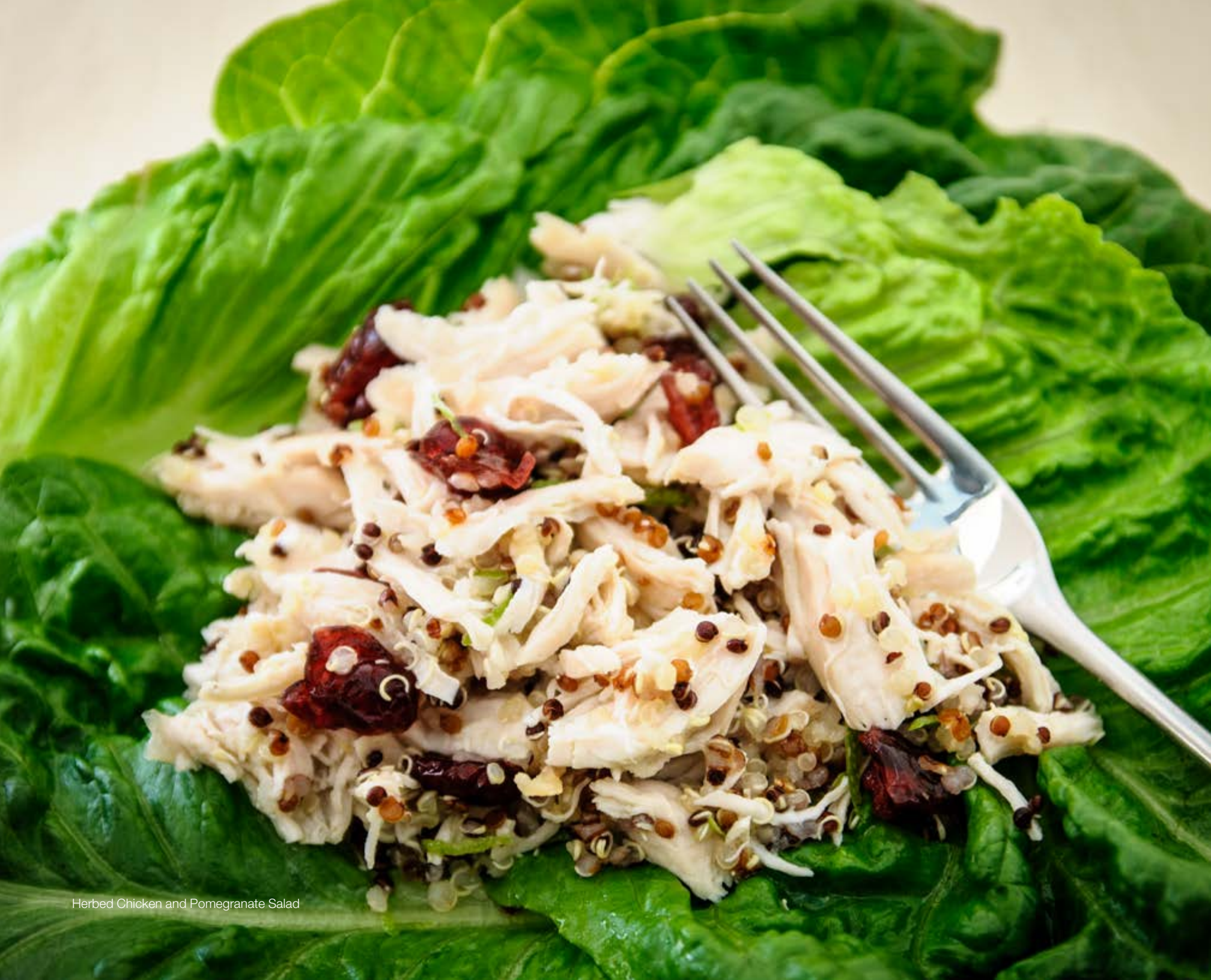
Herbed Chicken and Pomegranate Salad