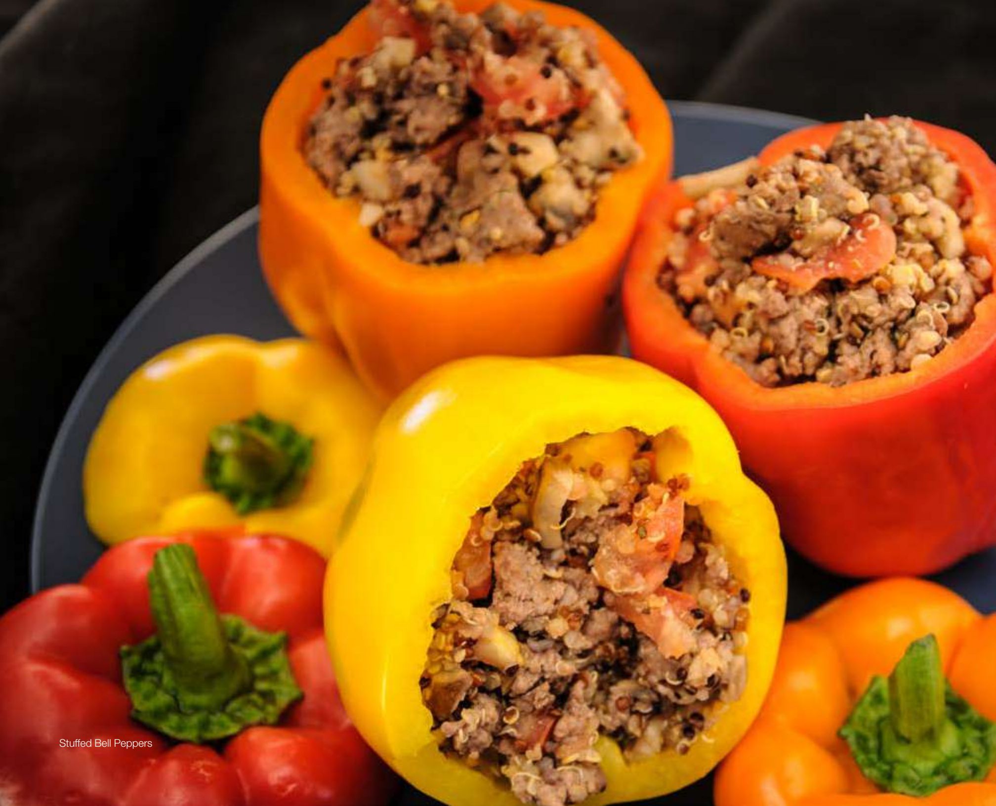
Stuffed Bell Peppers