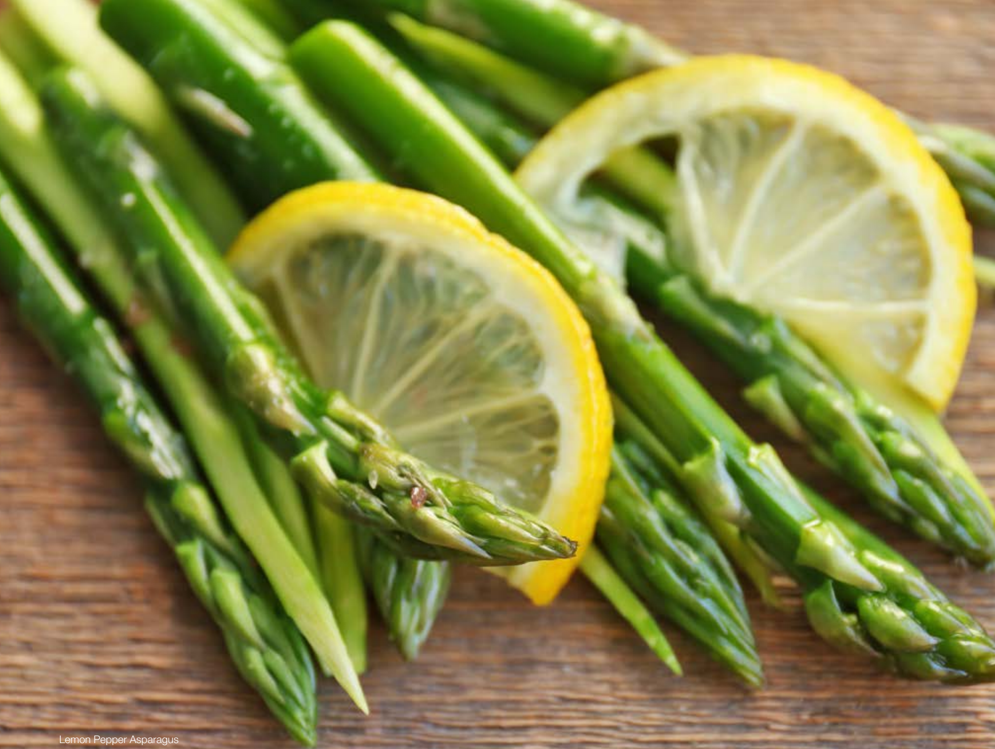
Lemon Pepper Asparagus