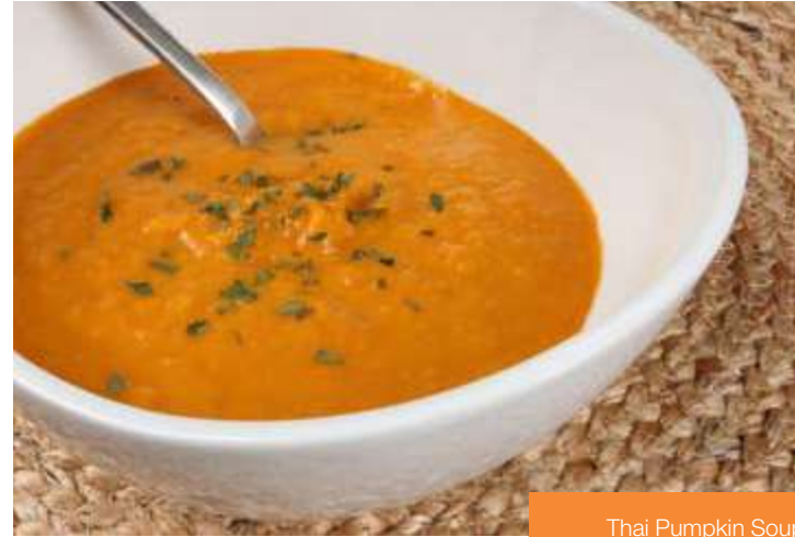
Thai Pumpkin Soup

Sauté onion in olive oil until soft. Add tomato paste, pumpkin, ginger, garlic, and broth. Combine until thoroughly heated and place in blender. Add chilies, coconut cream, coconut milk, and lemon juice. Blend for 30 seconds. Season with sea salt and pepper to taste. Serve immediately. Note: If a less sweet soup is desired, omit coconut cream and increase coconut milk to 1½ cups. Serves 2-4.