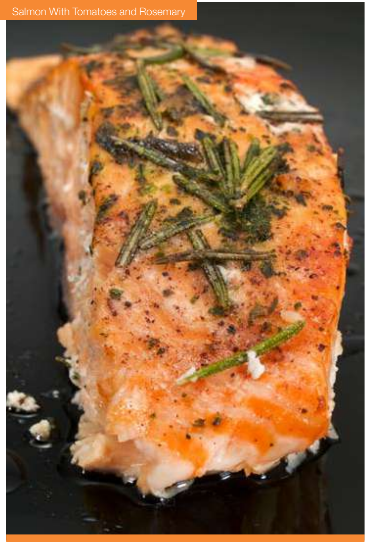
Salmon With Tomatoes and Rosemary

In a medium sauté pan, heat oil at medium-high heat. In a small bowl, combine the spices. Turn the salmon fillets in the spices, covering all sides. Place the salmon fillets (skin side under) in pan. Cook for 3-5 minutes before turning over. Cook another 3-4 minutes or until done. Serves 2.