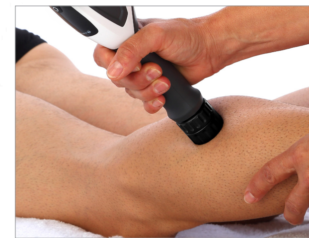
Trigger point in the calf