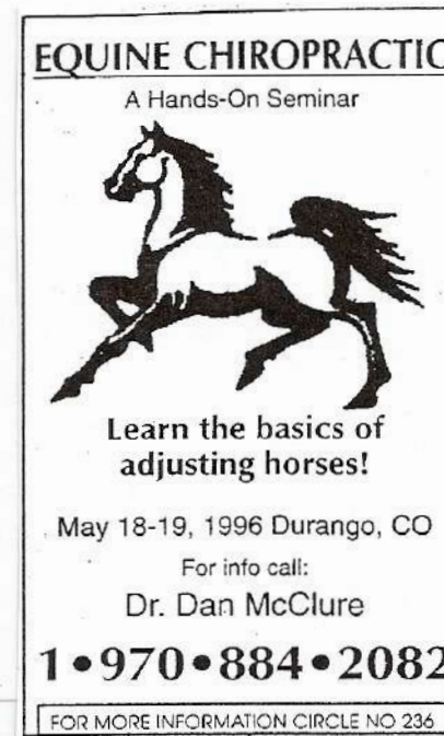
Figure 1 Advertisements for courses, videos and seminars in animal chiropractic. In the publication 'Dynamic Chiropractic' Circa 1995-1998.