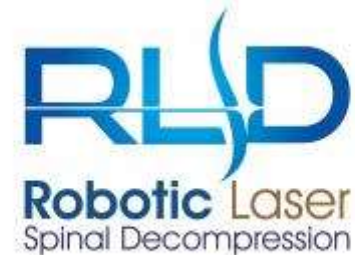
Non-Surgical Robotic Laser Spinal Decompression