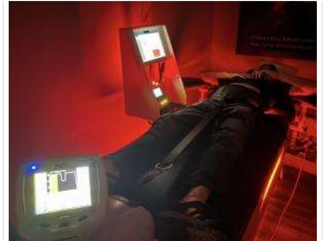
Robotic Laser Spinal Decompression Treatment

3 http://drjrz.clickfunnels.com/copy-of-spinal-decompression-advertorial6o0kyjr3