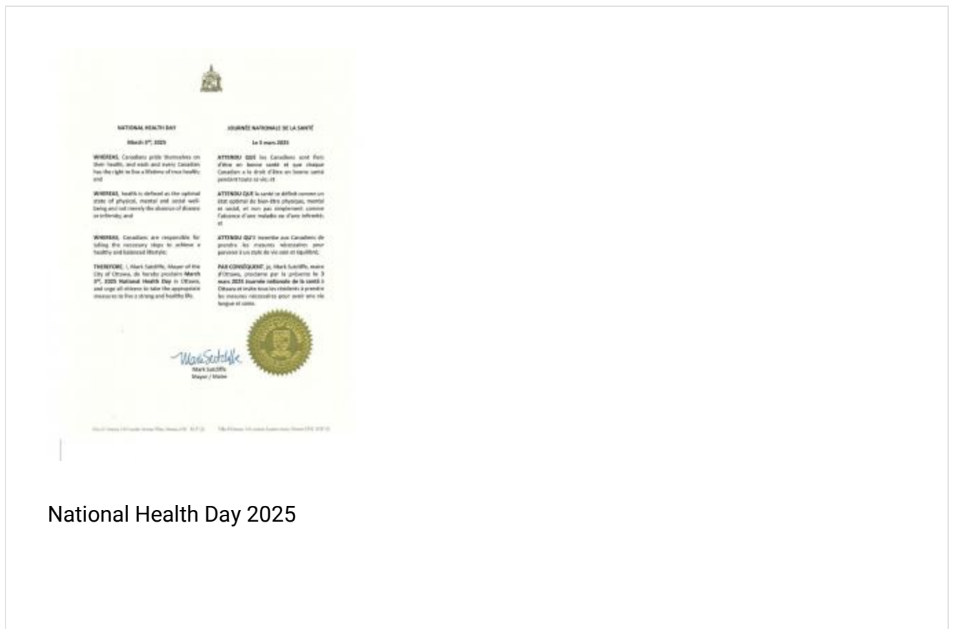
National Health Day 2025