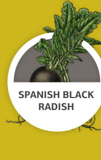
SPANISH BLACK RADISH