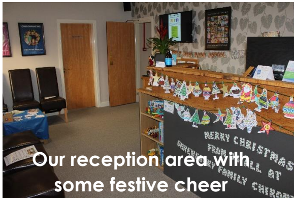
Our reception area with some festive cheer