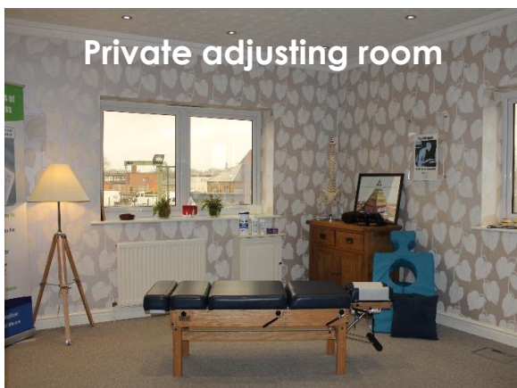
Private adjusting room