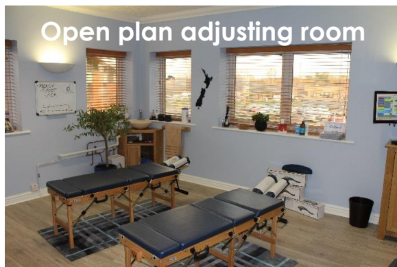
Open plan adjusting room