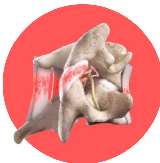
SUPPORT LIGAMENT INJURY Causing Excessive Motion