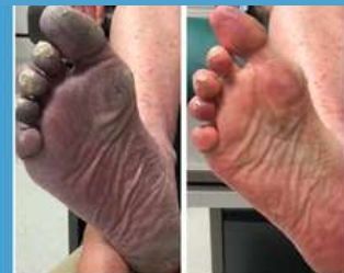
Improved circulation with SoftWave therapy