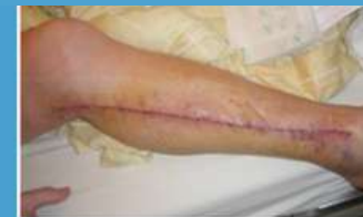
14 Days after surgery without SoftWave therapy