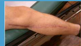
14 Days after surgery WITH SoftWave therapy

OUR TREATMENT COSTS ROUGHLY 90% LESS THAN SURGERIES OR STEM CELL INJECTIONS